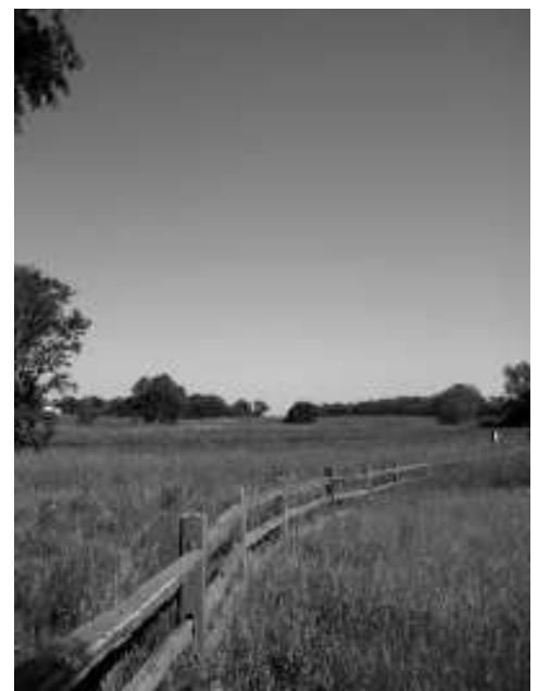
Oak Openings, Liberty Prairie Conservancy