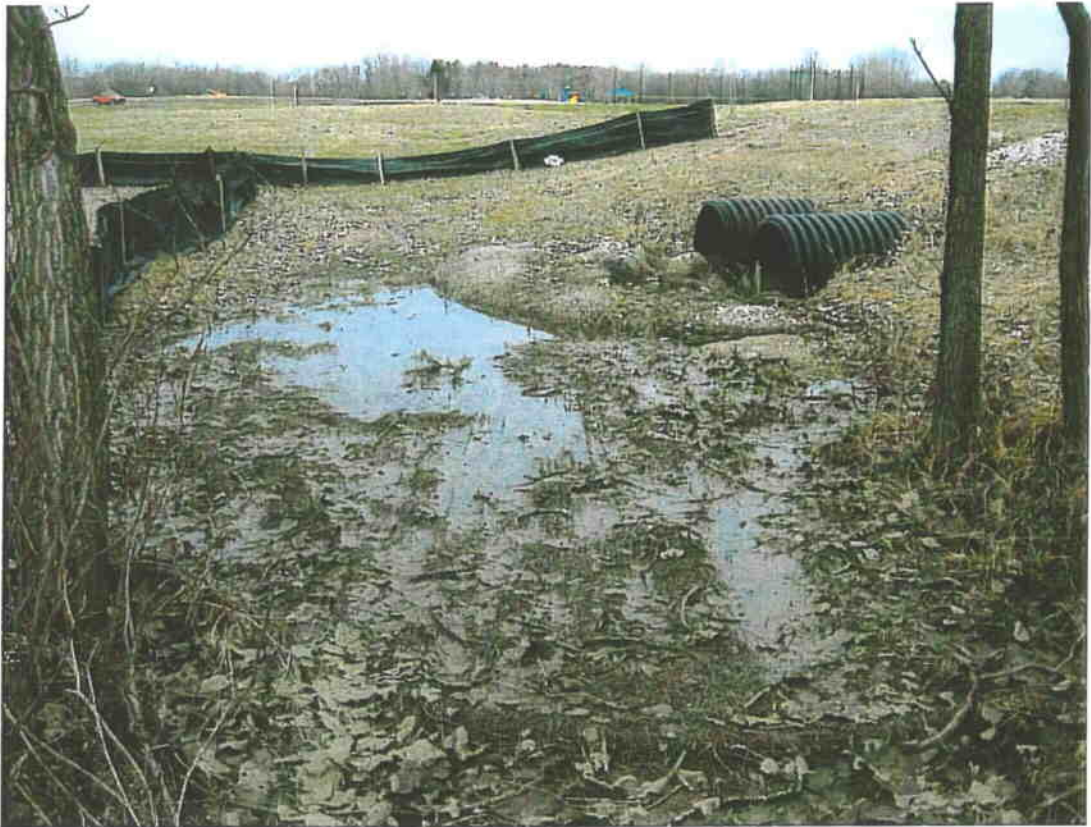
Figure 1-Place rip rap downstream of twin 30" culverts.