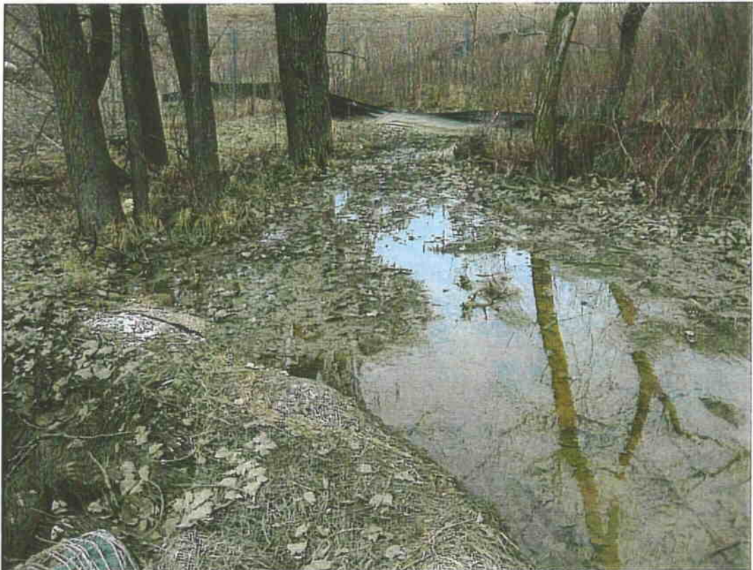
Figure 2-Repair silt fence downstream of culverts that was over run by water.