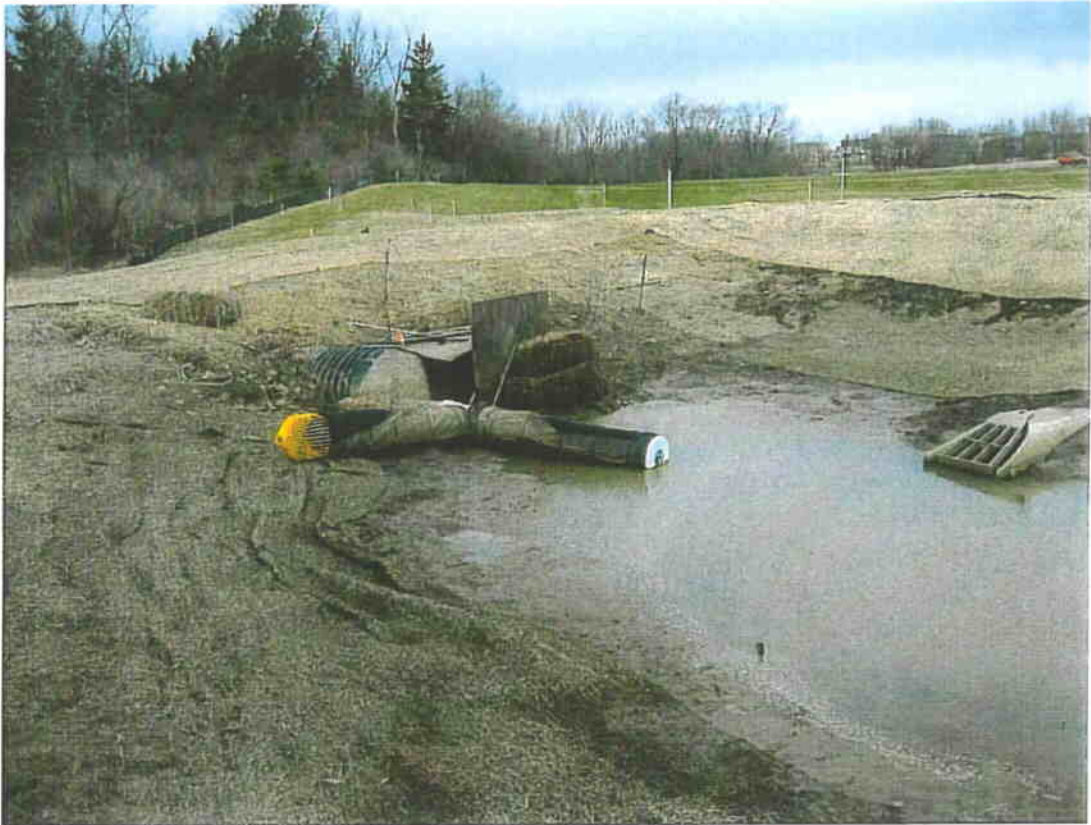
Figure 3-Re-set perforated riser to vertical position in 30" culvert.