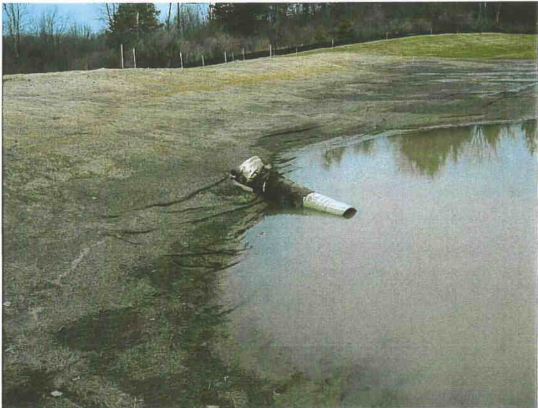
Figure 4-Re-install perforated riser in pretreat area.