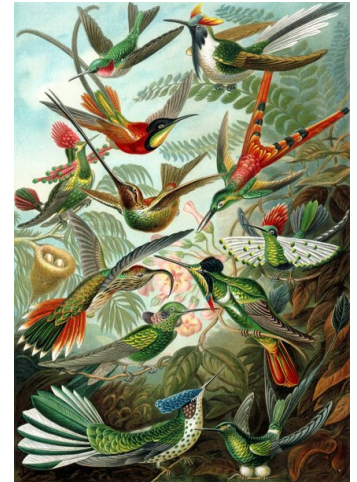
Ernst Haeckel's Kunstformen der Natur showing a variety of hummingbirds (1904).