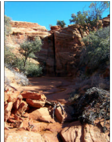
Utah wilderness