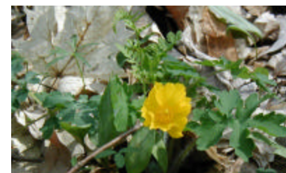
Wildflowers of Southern Illinois