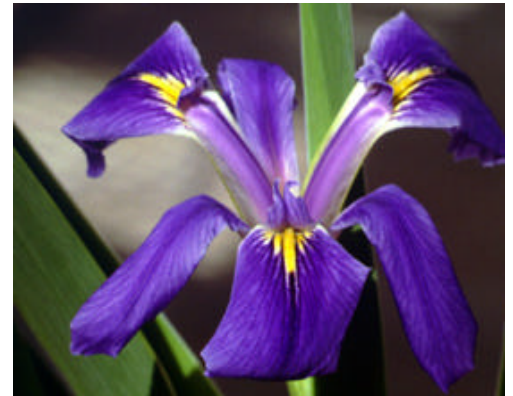
Iris brevicaulis Rafinesque (Short-stemmed iris)

The native irises that can be readily grown in the garden are available from a number of commercial suppliers.