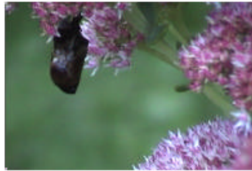
Pupa in Clara's garden