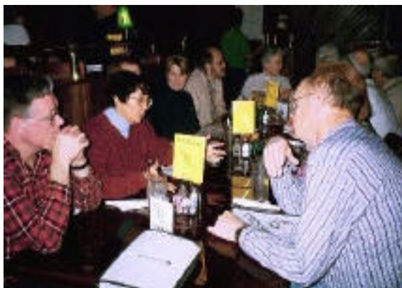
Dinner before meeting at Mugsy Mcquires

The following pictures should help to give members a better idea of member participation in the Shawnee Group of the Sierra Club...editor.