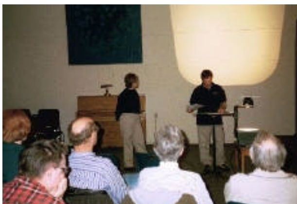
Presenters at the General Membership Meeting