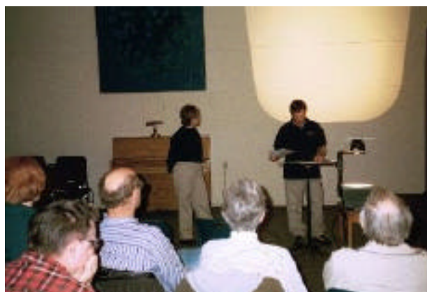
Presenters at the General Membership Meeting